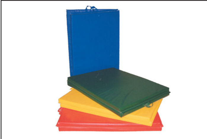
center fold mats with handles