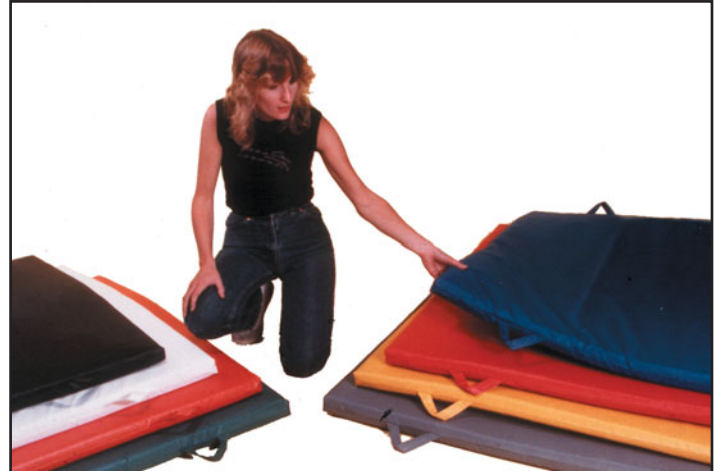
non-folding mats with handles

Vinyl coated nylon cover is strong, mildew resistant, anti-bacterial and wipes clean with a damp cloth. Mat is made with square side walls and is reinforced at all stress points for added durability. Reinforced handles can be used to carry and to store mat. Available in centerfold for easy handling and storage and non-folding styles. SEE PAGE 50 for color choices and foam descriptions.